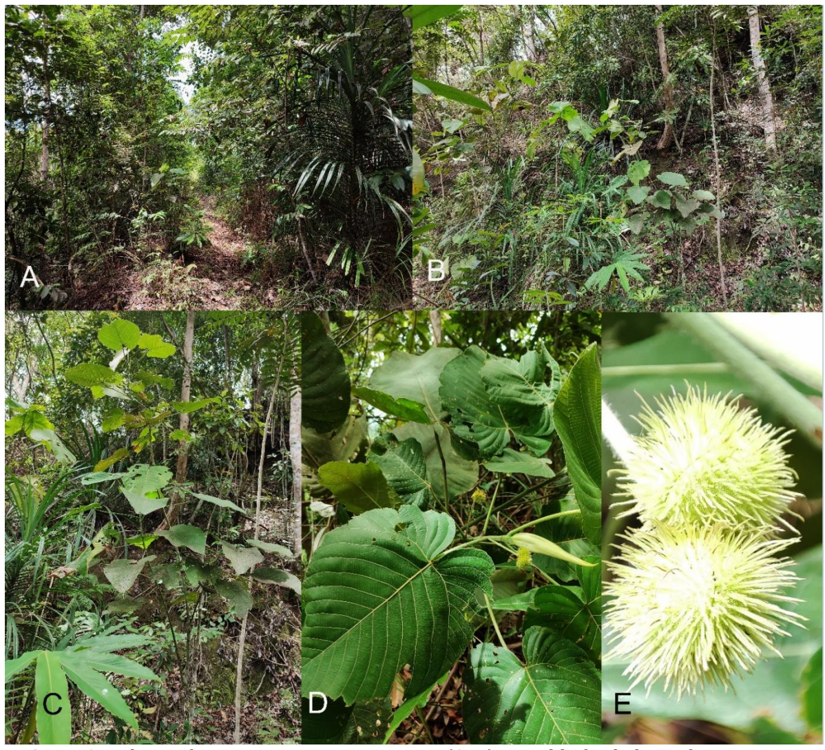
Figure 3. Habitat of Metapocyrtus poncei sp. nov. (A–B), Possible food plant of Metapocyrtus poncei sp.nov. - Macaranga hispida (Blume) Müll. Arg. (C–E).