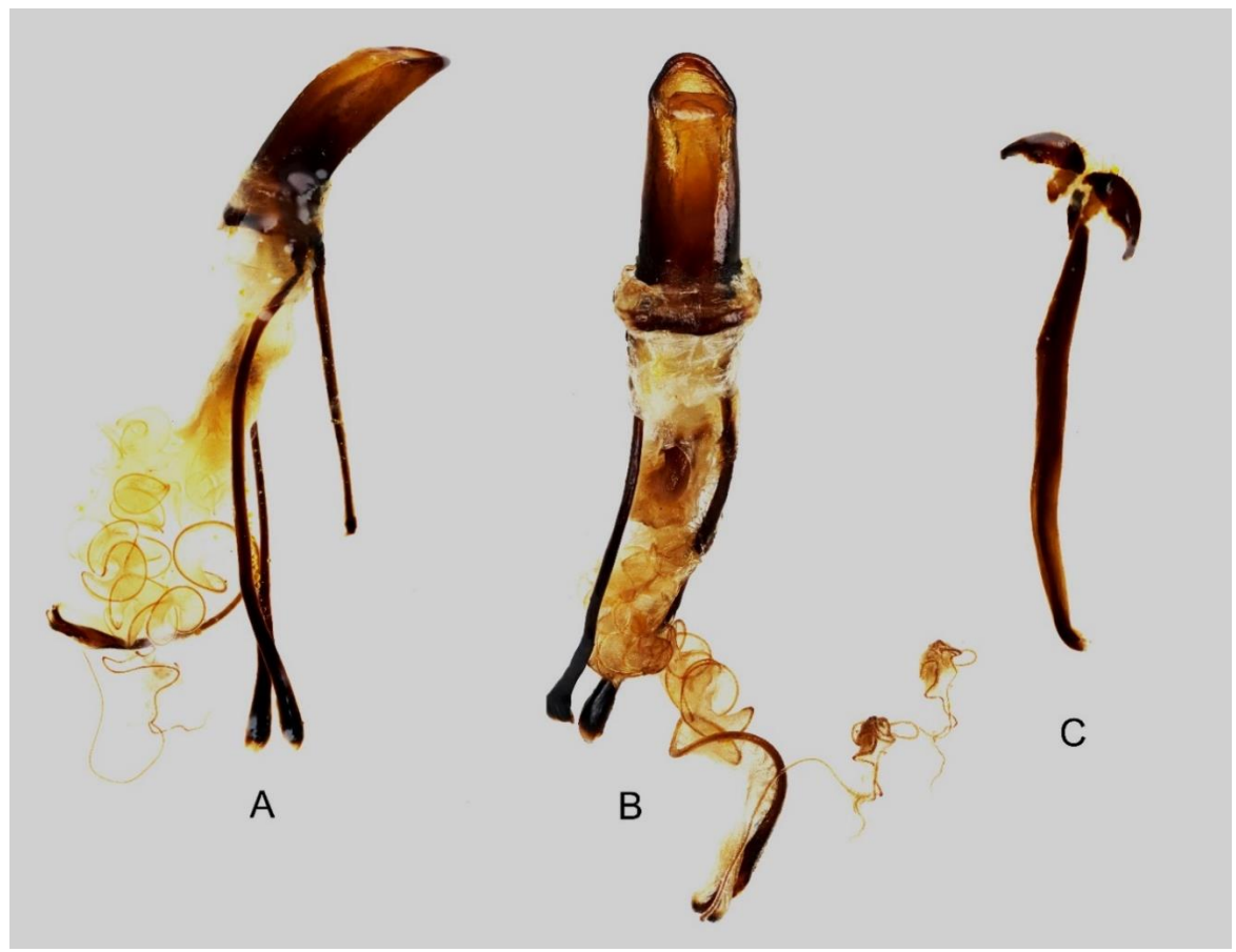
Figure 2. Metapocyrtus poncei sp. nov. aedeagus A lateral view, B dorsal view, C sternite IX in dorsal view.